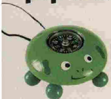
A cute way to stay on course. Garden Trails Compass , $3, karmakiss.com

Every Scout knows it's best to be prepared! These little extras will help make each outing a success.