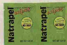
Apply DEET-free insect repellent neatly and easily. Natrapel Bug Wipes , $6 for 12, tendercorp.com