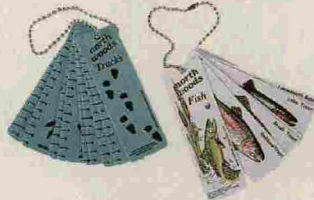
Attach these waterproof reference cards to a belt loop or backpack. North Woods Field Guides , $10 each, naturepavillon.com